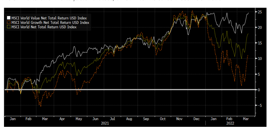
Fig.1. MSCI World and World factor indices, in GBP terms since December 2020

The <u>"great rotation" to Value began towards the end of 2020</u> as inflation fears came into focus and investors have been rewarded accordingly. From 31<sup>st</sup> December 2020 to 23<sup>rd</sup> March 2022, the MSCI World Value factor has delivered returns of +24.63% returns compared to +10.73% return for Growth factor and +17.89% for the parent MSCI World index, all in GBP terms.